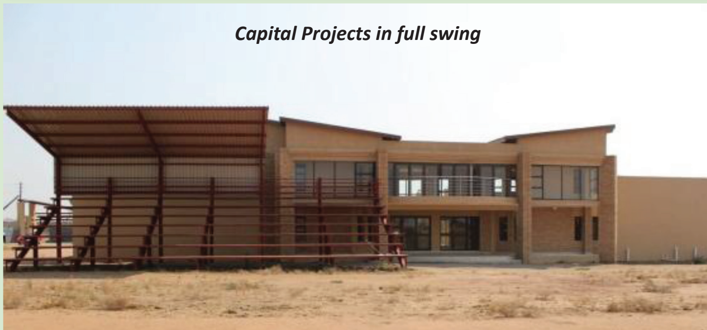
Capital Projects in full swing