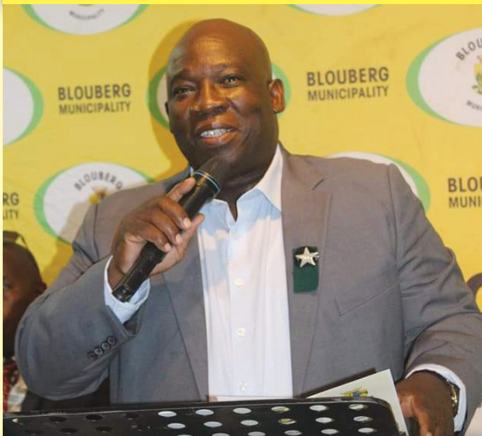
The Mayor, His worship, Cllr Maseka Pheedi addresses members of the public during the Imbizo programme

As part of government's concerted commitment to enhance participatory democracy, the Blouberg Municipality had a Council Imbizo programme at Leokaneng Village in Ward 22 on the 29th of March 2019.